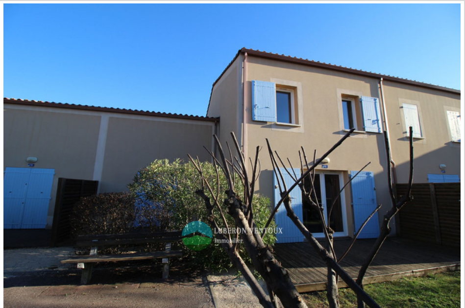
House 4517 Aubignan

Holiday home for 6 people. For a rental investment. Pretty holiday home, very well appointed and fully equipped for 6 people! Open living room and separate WC downstairs. Upstairs, you find two real bedrooms with windows and a bathroom with WC. You have a private 14m 2 terrace in the middle of the greenery and a parking space. Lease in progress, but you can benefit from two weeks of occupation. The area is equipped with swimming pools and sports activities in a wooded park maintained for you! It is located near Aubignan (village with all shops 1 km away) and Carpentras (about 5 km small town with train station, cinema, media library), Beaumes-de-Venise and less than 30 minutes from the entrance from the highway and Avignon or Isle sur la Sorgue. This bastidon is offered at the price of €70,200 FAI REF: 4517 For more information, contact us at the Aubignan agency on 04.90.62.06.06