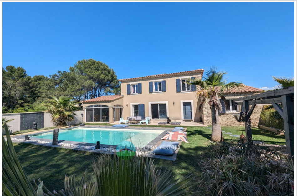
Villa 50462 Aubignan

Fees paid by the owner, no current procedure, information on the risks to which this property is exposed is available on georisques.gouv.fr