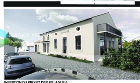
INSERTION DU PROJET DEPUIS LA VUE 5