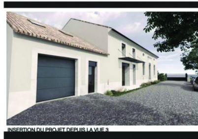
INSERTION DU PROJET DEPUIS LA VUE 3