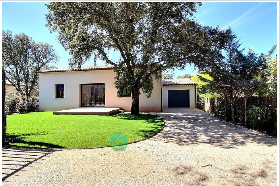
House 40710 Saint-Didier

Exclusively . Close to PERNES LES FONTAINES and 1 km from the charming village of Saint Didier, come and visit this pretty new house on a pretty wooded garden. of 360m 2 land for swimming pool, the rest being an access path! On one level composed of a beautiful living room with kitchen, 2 bedrooms, a bathroom and a garage of 26 m 2 . Perfect for a base in Provence or for a first purchase... To see very soon!! For this reference 40638 contact AGENCE DE SAINT DIDIER 04 90 51 13 58